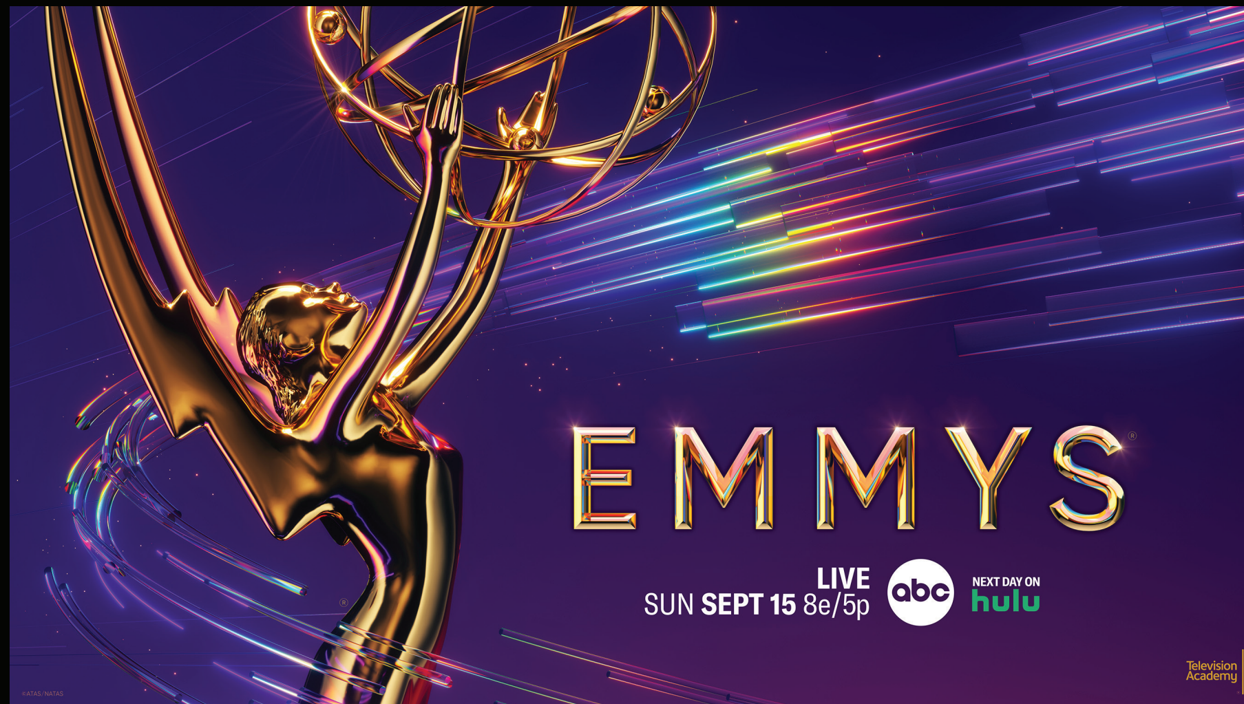
ABC/Hulu Tune-in Version