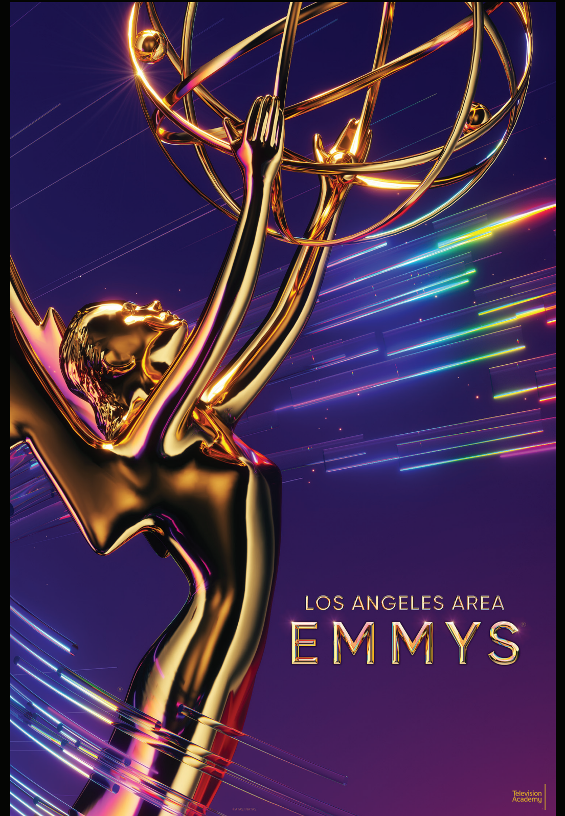
Los Angeles Area Version